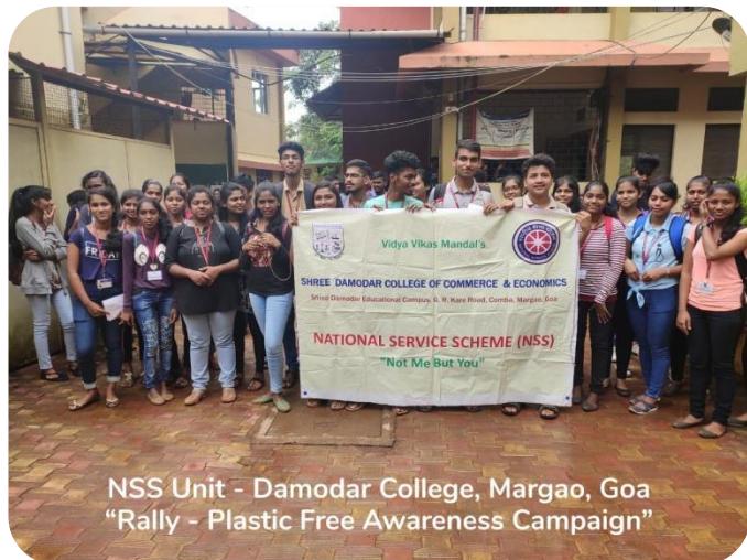
NSS Unit - Damodar College, Margao, Goa "Rally - Plastic Free Awareness Campaign"

61 B.Com students participated in the rally. At the rally, the students shouted slogans such as 'Ek Do! Ek Do! Plastic KoPhek Do!', 'Use paper bags, reduce plastic bags', etc. and also simultaneously created awareness among all the shopkeepers in the area. Students divided themselves into groups, conducted door-to-door awareness on dry waste segregation, advised the shopkeepers to keep the dry waste and informed them as to the date of collection.