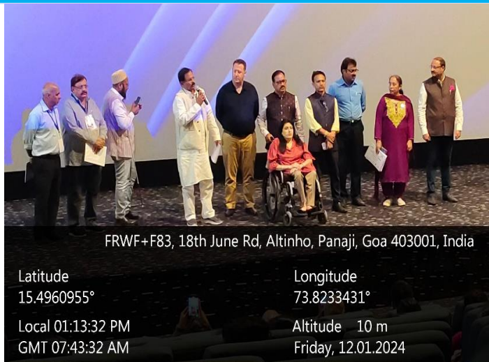
FRWF+F83, 18th June Rd, Altinho, Panaji, Goa 403001, India

Latitude 15.4960955° Longitude 73.8233431° Local 01:13:32 PM GMT 07:43:32 AM Altitude 10 m Friday, 12.01.2024