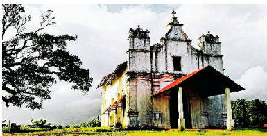
Three kings church