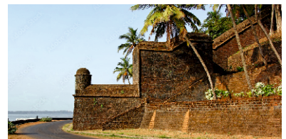
Reis magos fort