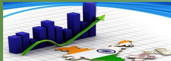
Developmental & Regulatory Role