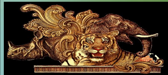
Issuer of Currency