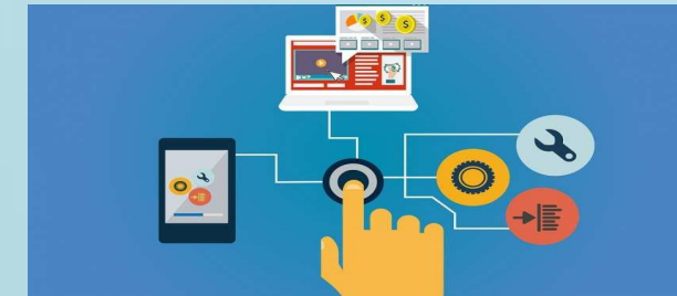
Overseeing Payment Systems