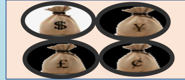
Manager of foreign exchange