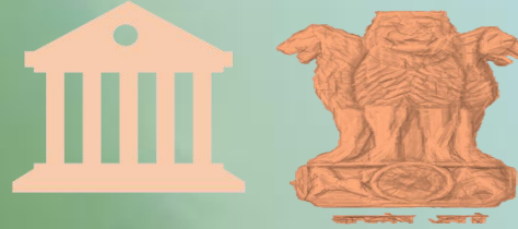
Banker to Government