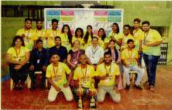
Winners from Shree Damodar College of Commerce and Economics, Margao with their medals on the concluding day of the Inter Collegiate Judo Championship