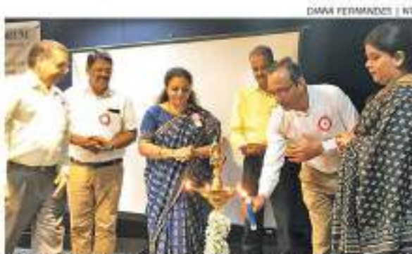
One of the dignitaries lighting the traditional lamp at the 'Adharniya' event held to commemorate the World Elders Day.

"We, as a society, are responsible for the present situation our elders are facing like isolation. We need to change our attitude and learn to respect our elders so that when we get old, our children also treat us with respect. Senior citizens should make use of