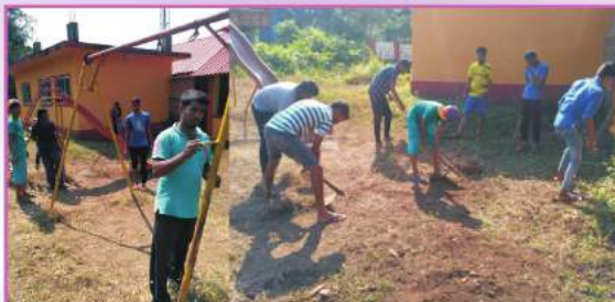
Cleaning and Painting of Government School