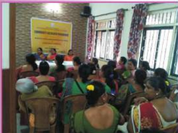
Community Outreach Programme