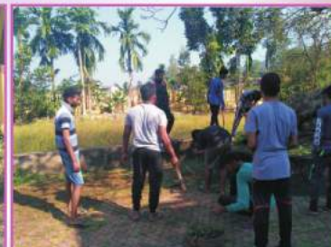
Participation in Swachh Bharat Abhiyaan