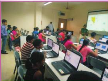
Scratch Programming for School Children