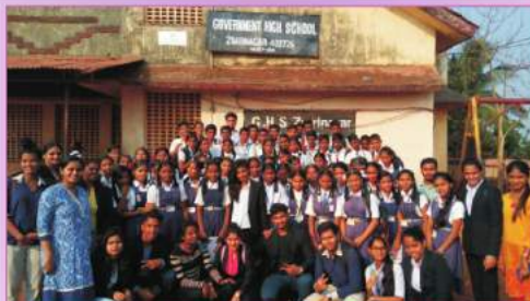
Young Leaders- Financial Literacy for Youngsters