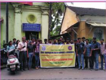
Visit to Old Age Home