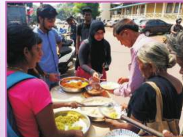
Serving the needy